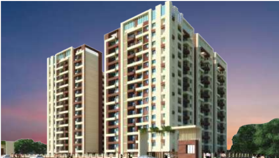
BCC KAILASA 2, 3 & 4 BHK APARTMENTS Sector 14, Vrindavan Yojna, Lucknow