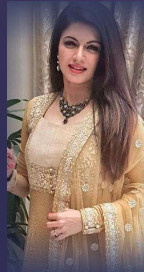
Bhagyashree Bollywood Actress