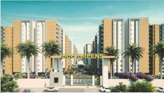
BCC GREENS 1, 2 & 3 BHK APARTMENTS Naubasta Kala, Deva Road, Lucknow