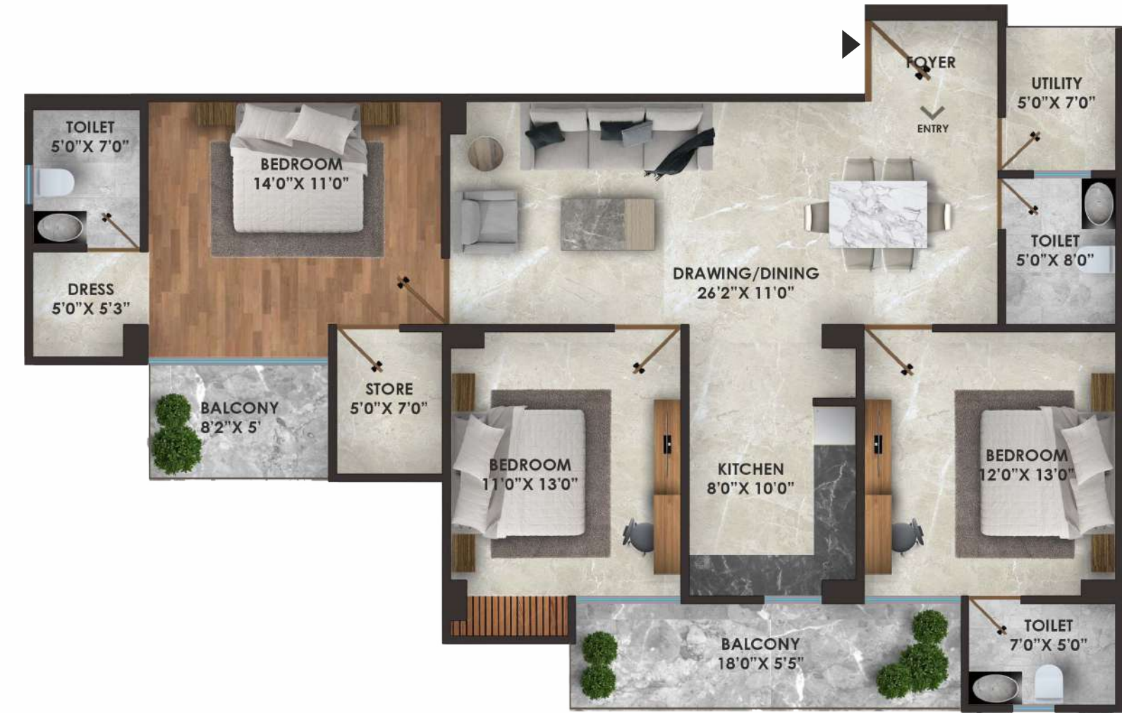
UNIT TYPE: 3 BHK AREA - 1690 Sq. Ft. (157.00 Sq.Mtr.)