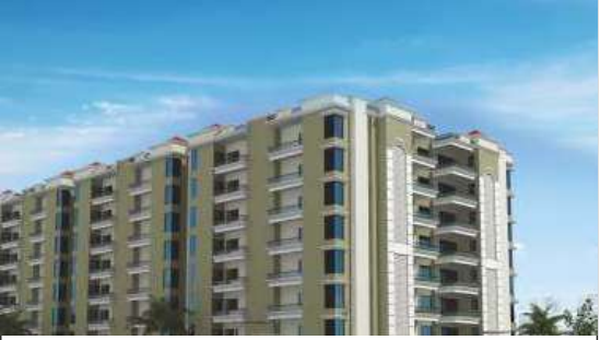
BCC VISION 3 BHK + SERVANT APARTMENTS Moti Nagar, Aishbagh, Lucknow