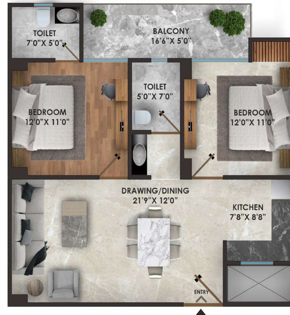
UNIT TYPE: 2 BHK (T-2) AREA - 1050 Sq. Ft. (97.54 Sq.Mtr.)