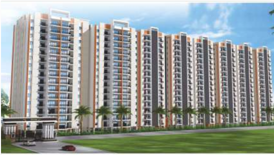
BCC HEIGHT 2 & 3 BHK APARTMENTS & LUXURY VILLA Raebareli Road, Near PGI, Lucknow