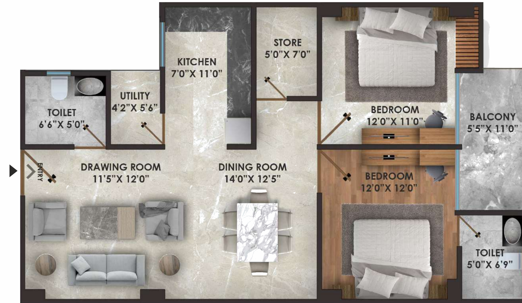
UNIT TYPE: 2 BHK (T-3) AREA - 1170 Sq. Ft. (108.69 Sq.Mtr.)