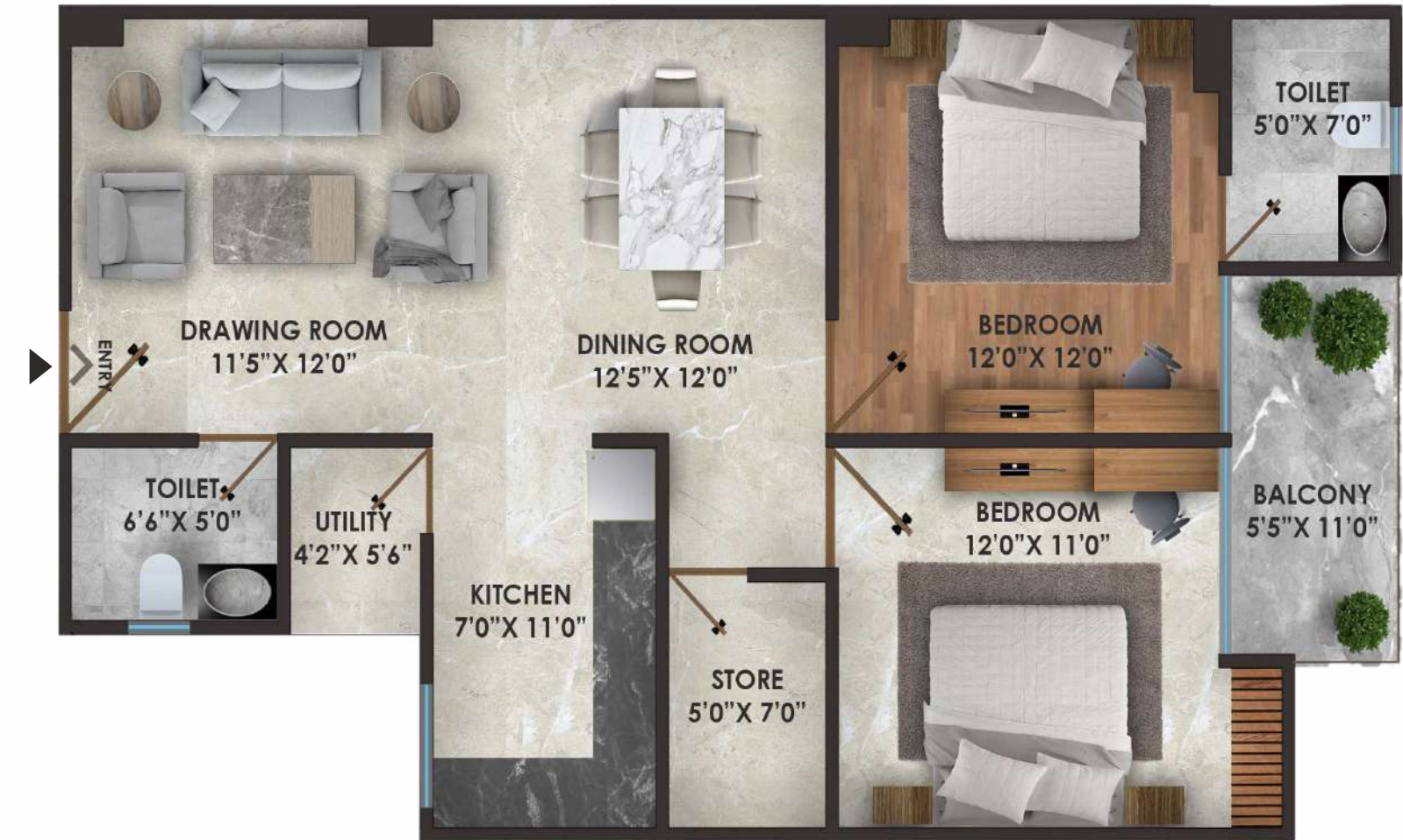
UNIT TYPE: 2 BHK (T-4) AREA - 1150 Sq. Ft. (106.83 Sq.Mtr.)