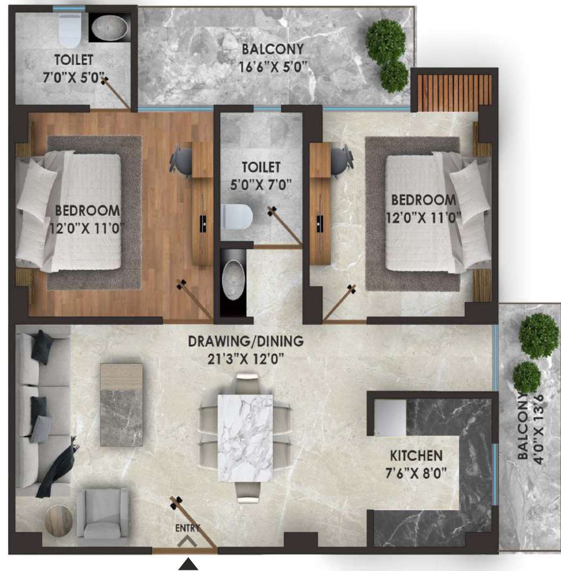
UNIT TYPE: 2 BHK (T-1) AREA - 1125 Sq. Ft. (104.51 Sq.Mtr.)