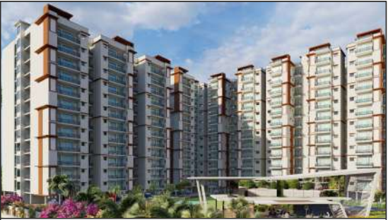
BCC ENCLAVE 2 & 3 BHK APARTMENTS Kanpur Road, Lucknow