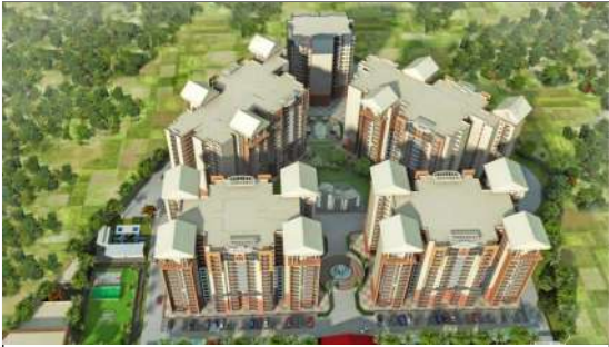
BCC ESTATE 3 BHK APARTMENTS Gomti Nagar, Lucknow