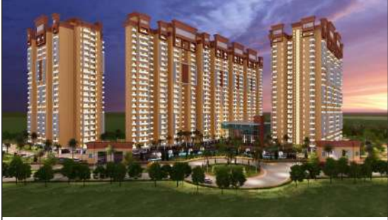
BCC GRAND 2, 3 & 4 BHK APARTMENTS Main Faizabaad Road, Lucknow