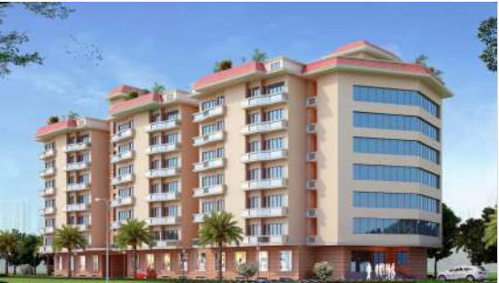
BCC CINE GRAND COMMERCIAL & RESIDENTIAL 3 BHK APARTMENT Hazratganj, Lucknow