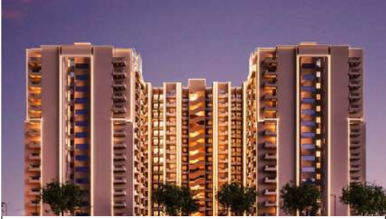
BCC BLUE MOUNTAIN 2 & 3 BHK APARTMENTS Sector 17, Vrindavan Yojna, Lucknow