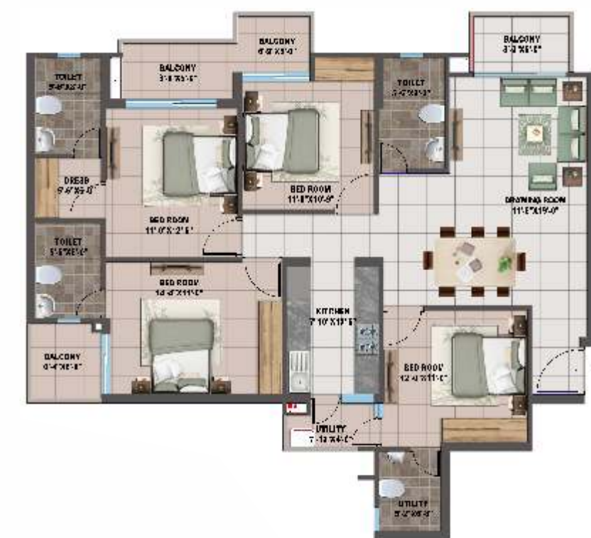
4 BHK 1900.00 Sq.ft. (176.51 Sq.Mtr)