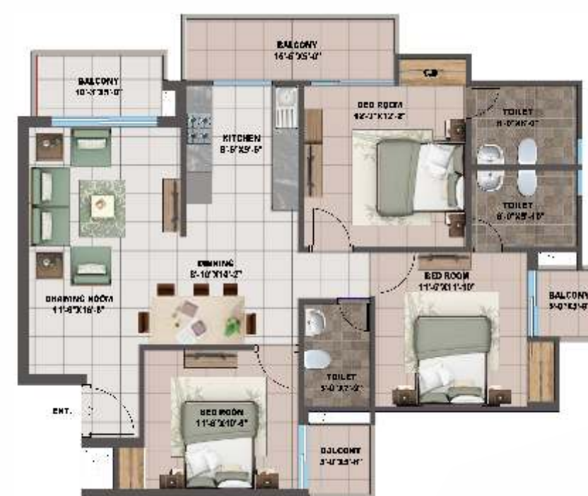
3 BHK 1600.00 Sq.ft. (148.64 Sq.Mtr.)