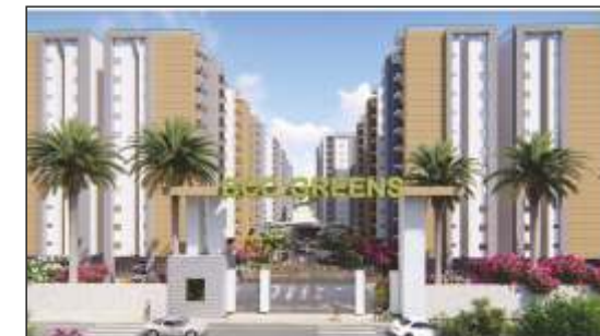
BCC GREENS 1, 2 & 3 BHK APARTMENTS & AFFORDABLE VILLA Naubasta Kala, Deva Road, Lucknow