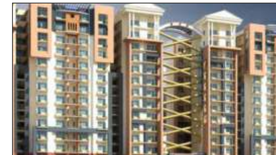
BCC ESTATE 3 BHK APARTMENTS Gomti Nagar, Lucknow