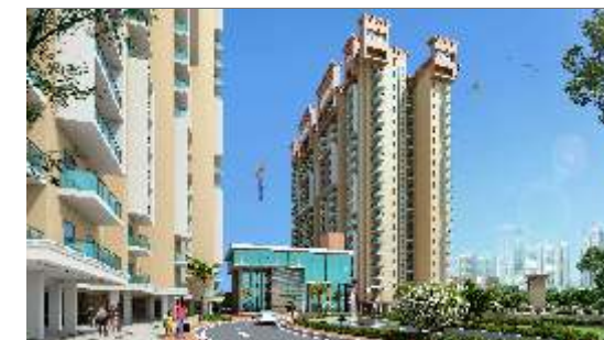
BCC GRAND 2,3 & 4 BHK APARTMENTS Faizabaad Road, Lucknow

Note : Visual representations shown in this brochure are purely conceptual. Building plans, specifications, layout plans etc. are tentative and subject to variation and modification by the company or the competent authorities sanctioning plans.