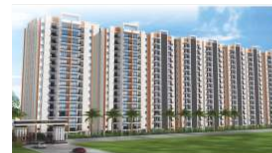
BCC HEIGHT 2 & 3 BHK APARTMENTS & LUXURY VILLA Raebareli Road, Near PGI, Lucknow