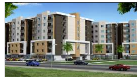
BCC RESIDENCY 2 & 3 BHK APARTMENTS Hazratganj, Lucknow