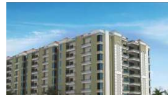
BCC VISION 3 BHK + SERVANT APARTMENTS Moti Nagar, Aishbagh, Lucknow