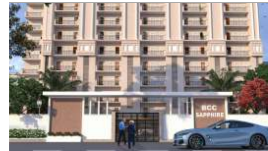
BCC SAPPHIRE 2 & 3 BHK APARTMENTS Arjun Ganj, Sultanpur Road