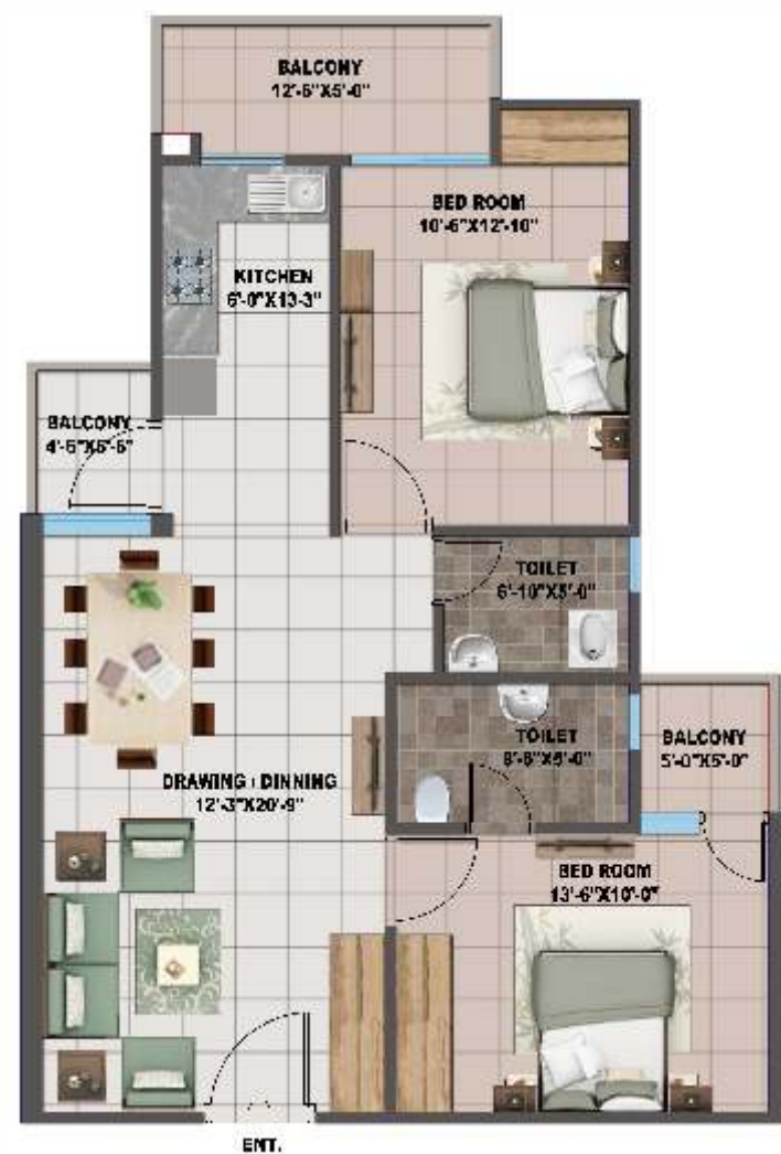
2 BHK (T1) 1050.00 Sq.ft. (97.54 Sq.Mtr)