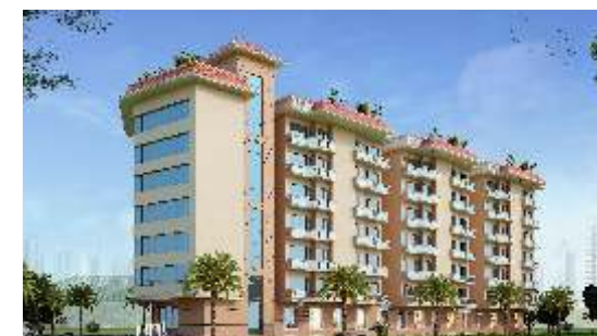
BCC CINE GRAND COMMERCIAL & RESIDENTIAL 3 BHK APARTMENT Hazratganj, Lucknow