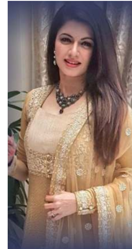
Bhagyashree Bollywood Actress