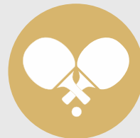
Table Tennis Court