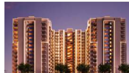
BCC BLUE MOUNTAIN 2 & 3 BHK APARTMENTS Sector 17, Vrindavan Yojna, Lucknow