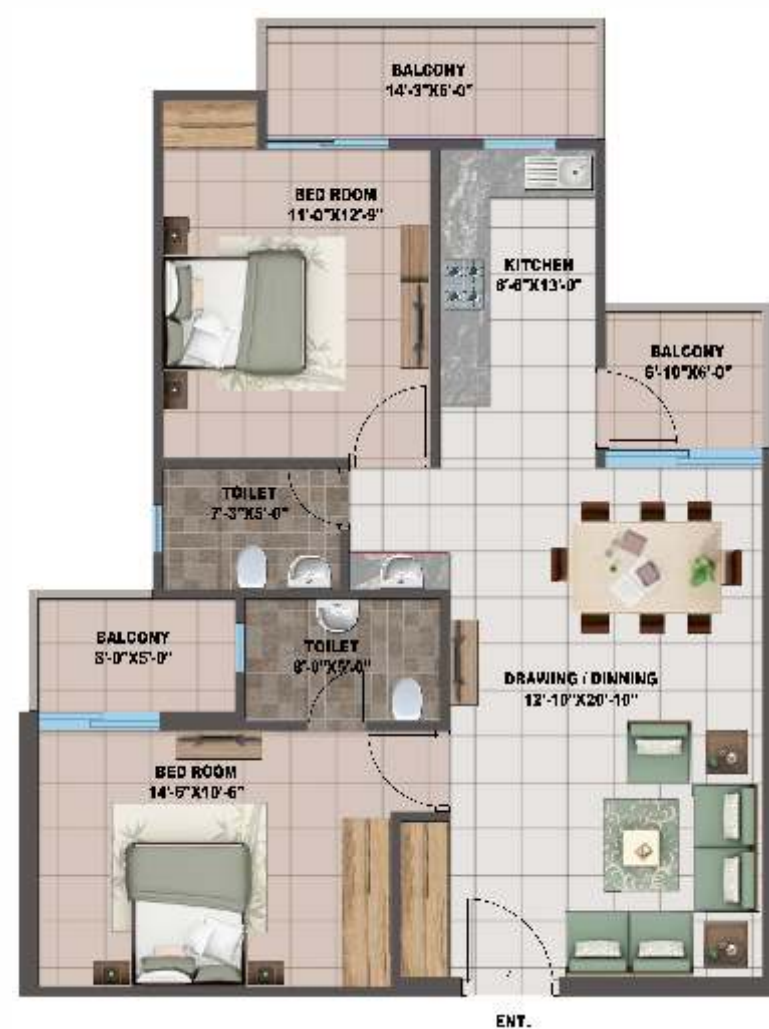
2 BHK (T2) 1200.00 Sq.ft. (111.48 Sq.Mtr)