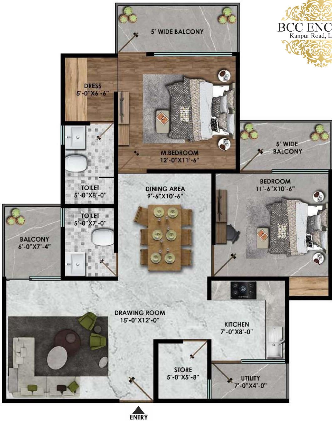
2 BHK UNIT PLAN AREA: 1050 Sq.Ft. (97.54 Sq. Mt.)