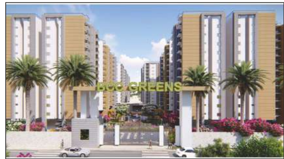
BCC GREENS 1, 2 & 3 BHK APARTMENTS & AFFORDABLE VILLA Naubasta Kala, Deva Road, Lucknow