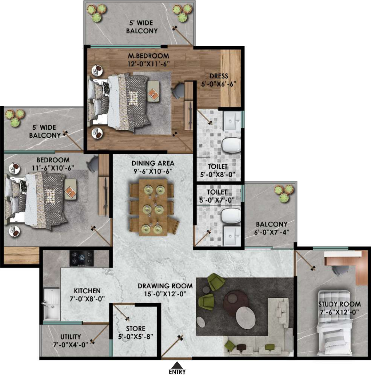
2 BHK + STUDY UNIT PLAN AREA: 1450 Sq.Ft. (134.75 Sq. Mt.)