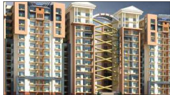
BCC ESTATE 3 BHK APARTMENTS Gomti Nagar, Lucknow