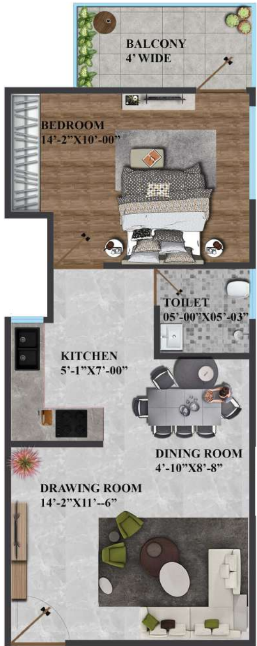
1 BHK UNIT PLAN AREA: 650 Sq.Ft. (60.38 Sq. Mt.)