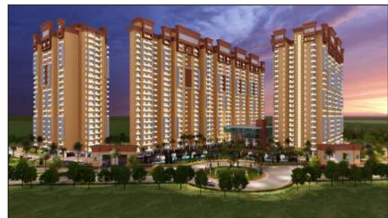
BCC GRAND 2, 3 & 4 BHK APARTMENTS Main Faizabaad Road, Lucknow