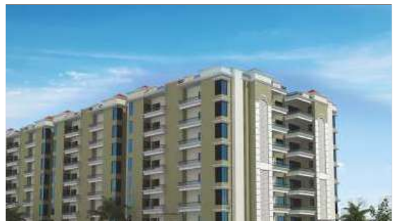
BCC VISION 3 BHK + SERVANT APARTMENTS Moti Nagar, Aishbagh, Lucknow