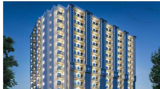
BCC SAPPHIRE 2 & 3 BHK APARTMENTS Arjun Ganj, Sultanpur Road